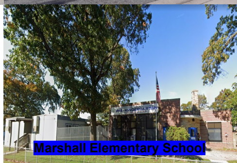
Marshall Elementary School