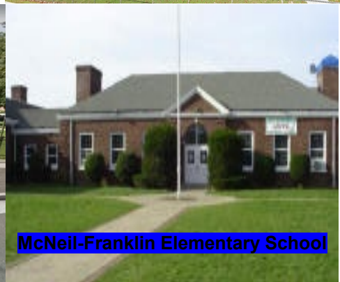
McNeil-Franklin Elementary School