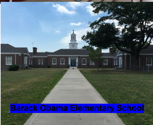
Barack Obama Elementary School