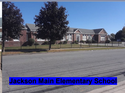
Jackson Main Elementary School