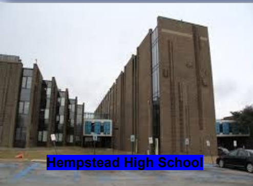
Hempstead High School