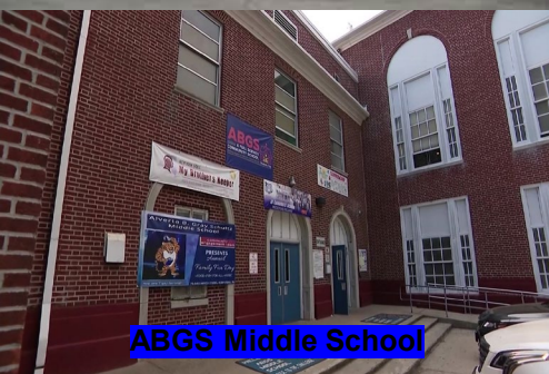
ABGS Middle School