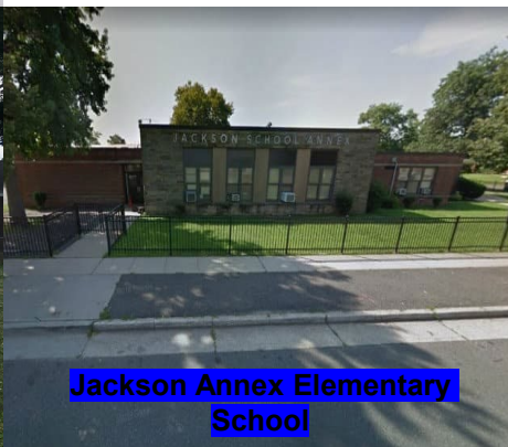
Jackson Annex Elementary School