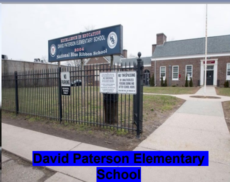
David Paterson Elementary School